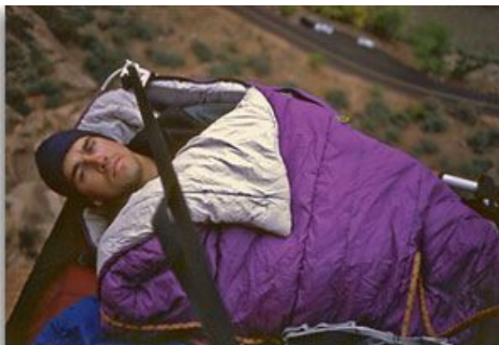
Great view, but...

Located on the eastern edge of Lake Placid, about 18 miles from us, this motel offers an indoor pool, hot tub, guest laundry facilities and game room. Rates: $150 and up (vary significantly with season).