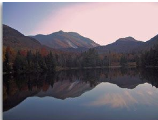
Still waters at dawn

If you are accompanied by friends or family, who will not be involved with one of our programs, you may prefer to stay in the village of Lake Placid. There are many attractions for children and adults nearby including the world-class Winter Olympic facilities (see Activities For Family & Friends ). There are also many restaurants and shops in the village. In good weather it takes about 20 minutes to drive from Lake Placid to Keene.